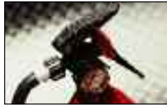
Fire extinguishing equipment.