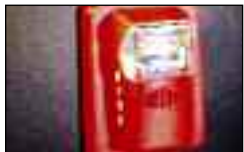
Early warning systems.

Church Mutual recommends that self-generating, pressure-type extinguishers, such as soda-acid units, be removed from service. They can explode and cause serious injury.